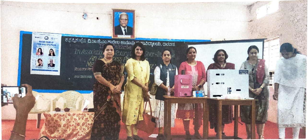
Photo 1: Staff of the college with members of Rotary Club of Seven Hills, Dharwad held on 21-09-2022