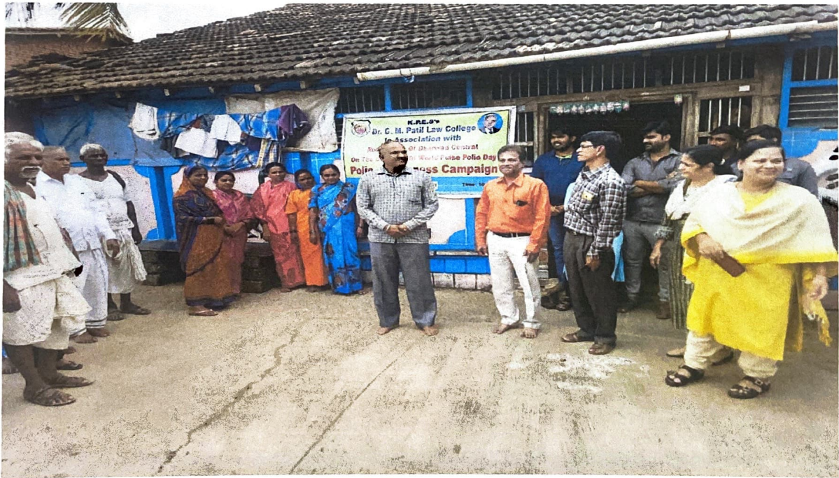
Photo 2: Polio Awareness camp held at Gambyapur Village in Dharwad District in Association with Rotary Club of Dharwad Central on 24-10-2019.