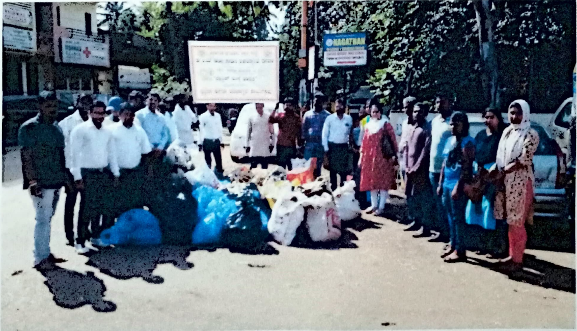
Photo 2: The plastic in the nearby premises of the college was collected for proper disposal by the students.

PRINCIPAL KPES's Dr. G. M. Patil Law College Near Tahashildar Office D. G. Compound, Dharwad-580001