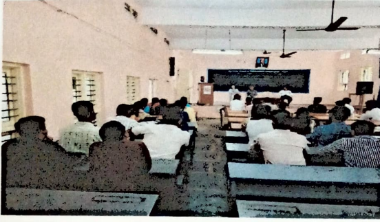
Photo 3: Students participating in the program held on 18-02-2021