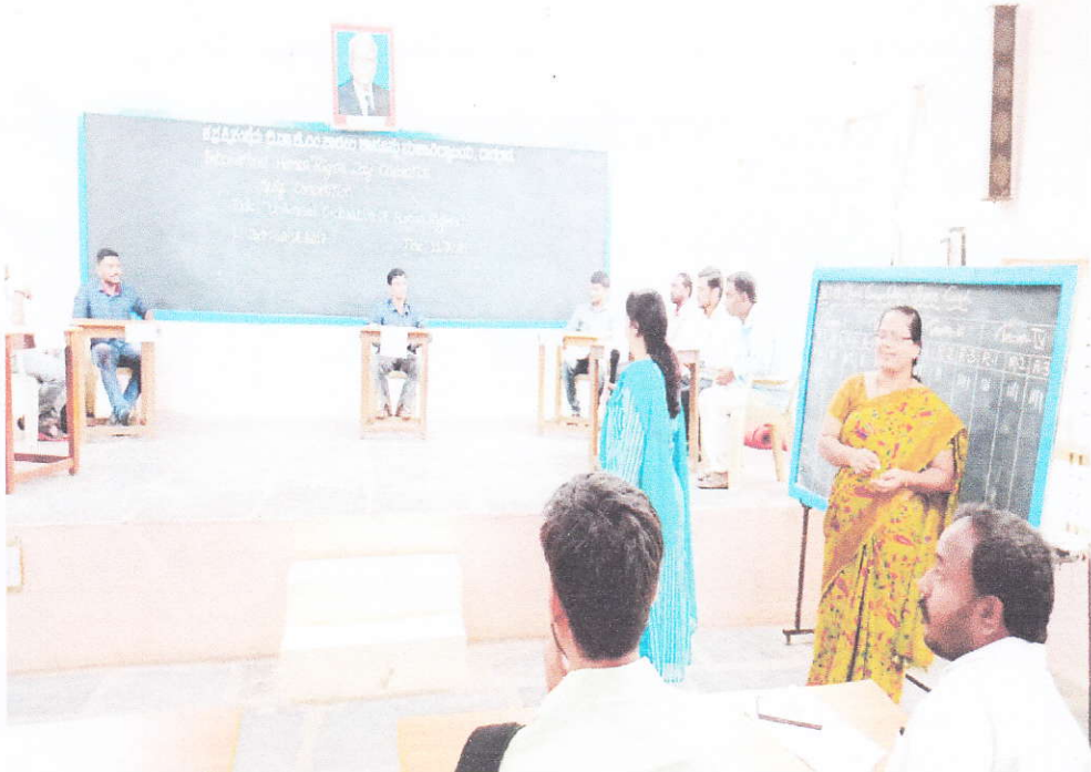
our students performing quiz competition